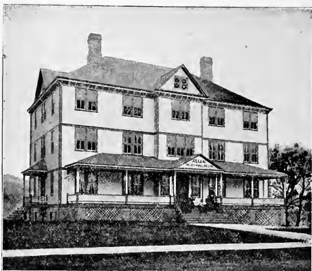
ASHEVILLE INDUSTRIAL HOME.

I have great pleasure in meeting the North Carolina Conference, a pleasure which I have long anticipated, but which has been impossible until now.